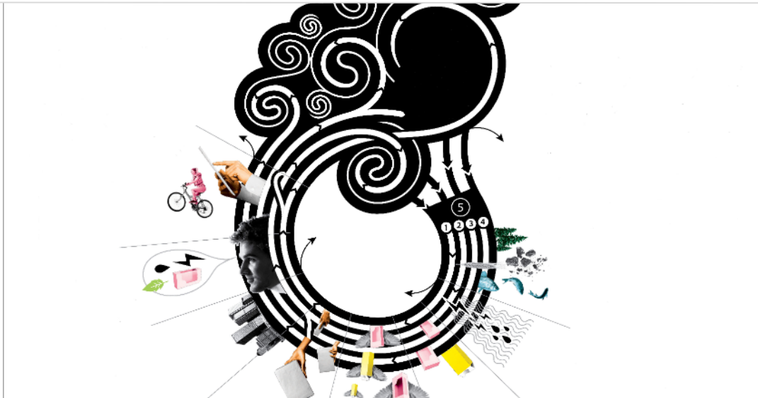
Leading the cycle: Finnish road map to a circular economy 2016-2025

Drafted during two interconnected projects on circular economy in 2016 & 2019