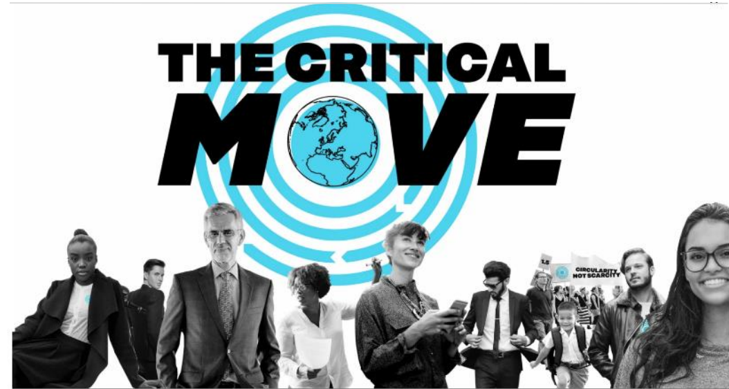
The critical move – Finland's road map to a circular economy 2.0

sitra.fi/en/projects/critical-move-finnish-road-map-circular-economy-2-0/