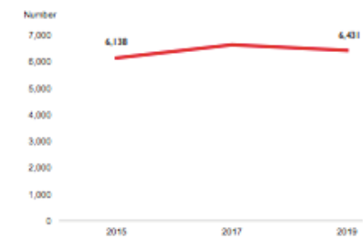
Figure 1. Homelessness in Denmark

Note: The figure shows the trend in the number of homeless people in Denmark between 2015 and 2019.