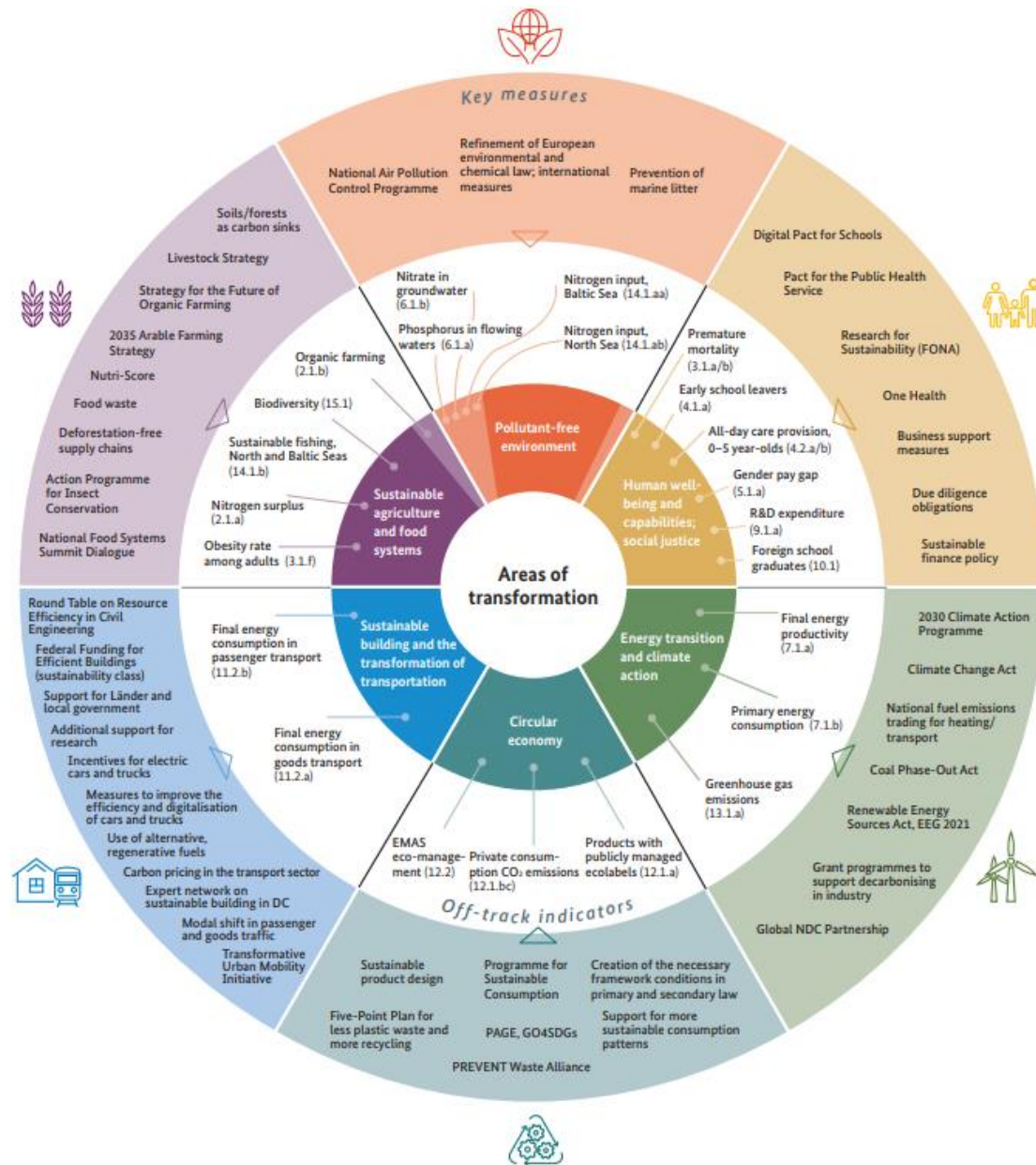
Figure 2 (German framework)

heavily based on the first GSDR (2019), only adding the lever of capacity building. 9 The second is a similar variant that is being used by the German Government since 2021. 10