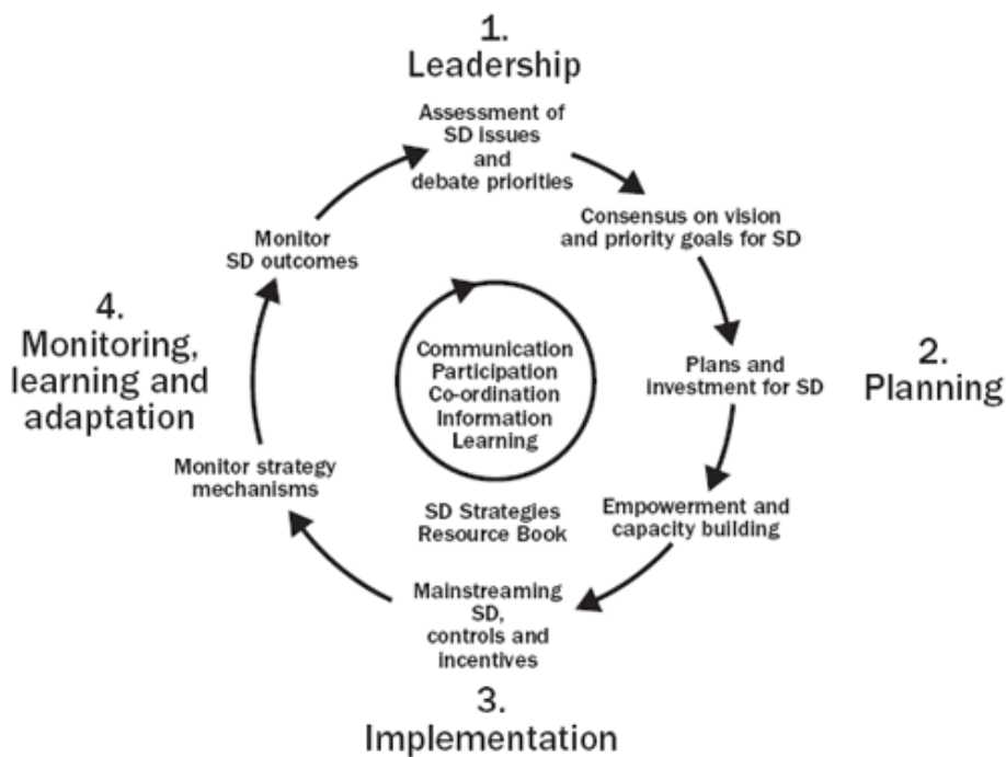
Figure 1: Steps in the strategic management of NSDS (Swanson et al, 2004, 5)

In order to increase the ‘steering role’ of NSDSs, comparative research (e.g. Steurer & Martinuzzi, 2005; Swanson et al, 2004) has shown that a strategic management approach is required. This approach involves several steps that are shown in Figure 1 below.